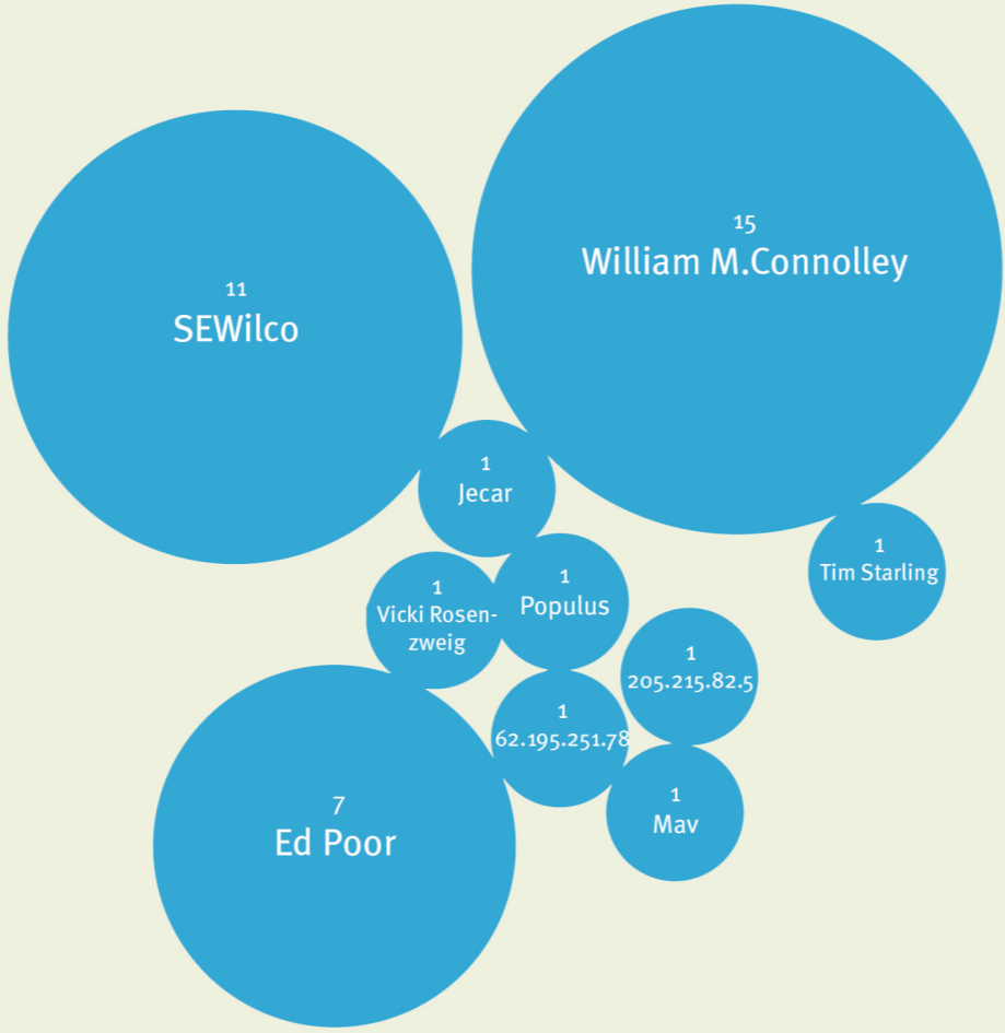
24 June to 24 September 2003